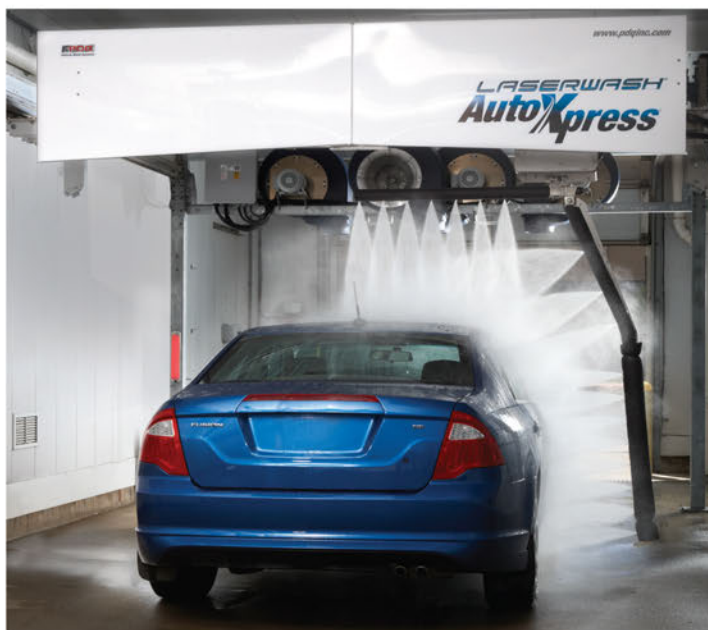
High pressure arch that travels 360° around the vehicle

PDQ's most recognized innovation is the unparalleled Virtual Treadle. This electronic vehicle-sensing technology eliminates drive-on floor-mounted mechanisms, creating a wide open bay that makes it easy for anyone at your dealership to use for either drive-through or drive-in/back-out wash bays. With the open bay design the LaserWash AutoXpress can wash the largest SUVs, vans and full sized pickup trucks, including duallys.