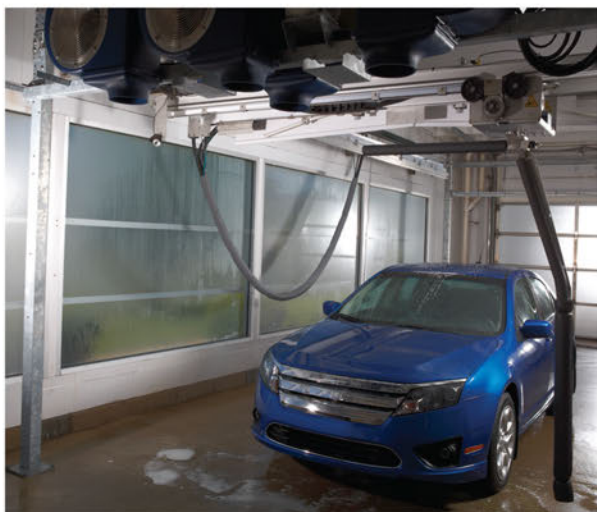
Wide open bay with no drive-on mechanisms