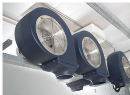
Optional frame-mounted dryer